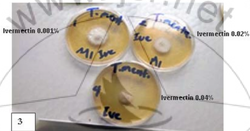
Figure 3: Shows the inhibitory effect of three concentrations of ivermectin on T. mentagrophytes as growth in vitro . Plate No.1, the concentration mean = 0.001% Plate No.2, the concentration mean= 0.02% Plate No.4, the concentration mean= 0.04%.