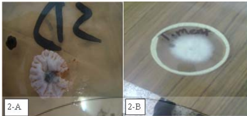
Figure 2: A: The shape of completely grow colony of T. verrucosum fungi on (SDA) at 37C°. B: The shape of completely grow colony of T. mentagrophytes fungi in (SDA) at 37C°